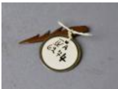
Harpoon head for otter hunting (IV A 6274)