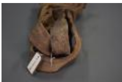
Leather strap for sea lion harpoon (IV A 6300)