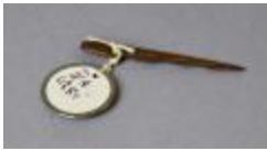
Harpoon head for otter hunting (IV A 6281)