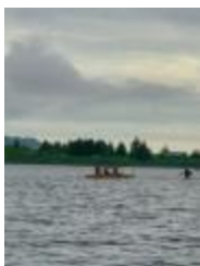
Nuuciq Lagoon (2021.007.012)