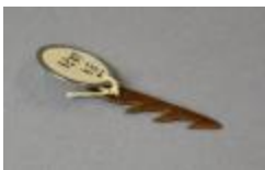
Harpoon head for otter hunting (IV A 6279)