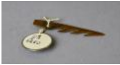
Harpoon head for otter hunting (IV A 6280)