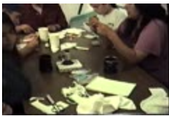
(June 23 1995 beach camp from video) no label (CM0158)