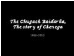
The Chugach Baidarka, The Story of Chenega 1933-2012 (1111.012.004)