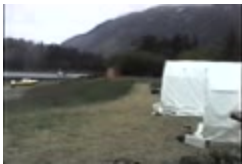
Nuuciq Spirit Camp '95 Tape 2 Master Tape (CM0420)