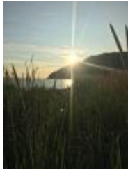
Nuuciq Beach Grass (2021.007.023)