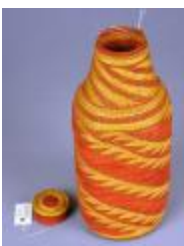
Bottle with lid (root weave) (IV A 6269 a,b)