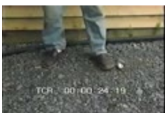
Nuchek Camp "Visor making raw unedited w/ time codes" 1 of 2 (CM0186)