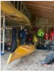
Nuuciq Qayaq Class (2021.007.005)