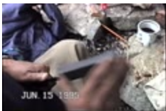
no label (CM0168)