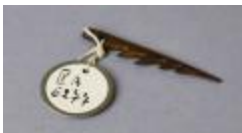
Harpoon head for otter hunting (IV A 6277)