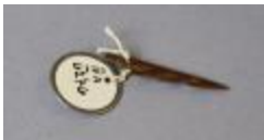
Harpoon head for otter hunting (IV A 6276)