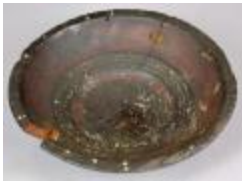
Eating bowl (IV A 6294)