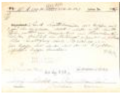
Harpoon head for otter hunting (IV A 6273)