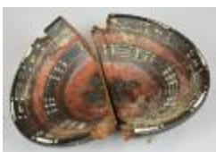
Eating bowl (fragments) (IV A 6290)