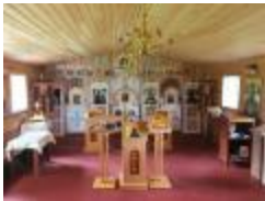
Nuuciq Church 2 (2021.007.016)