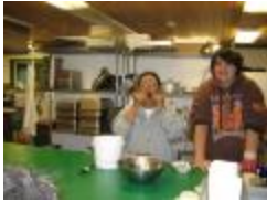
Aug 13 2007 Fireweed Berry / Jelly Nunchek Pictures (CM0331)