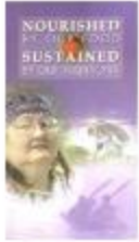
Nourished by Our Food Sustained by Our Traditions VHS (CM0030)