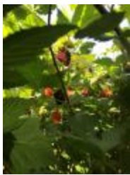
Qumalat Bush (2021.007.013)