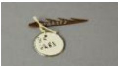
Harpoon head for otter hunting (IV A 6283)