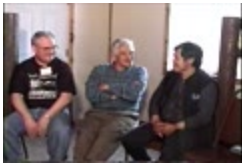
Interview at Nuchek - Markata/Nelson/Tabios - Implementing ANCSA 20000607 tape 1 (CM0092)