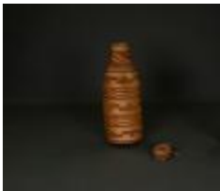
Bottle with lid (root weave) (IV A 6286)