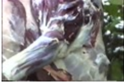
Part 1, 2, 3 (CM0283)