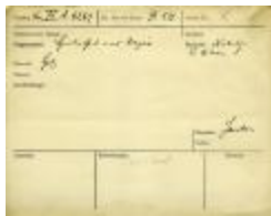
Kayak (back part) (IV A 6267)