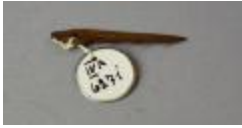
Harpoon tip for otter hunting (IV A 6271)