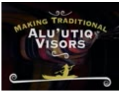
Making Traditional Alu'utiq Visors VHS (CM0025)