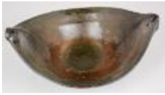
Eating bowl (IV A 6291)