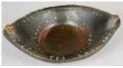
Eating bowl (IV A 6292)