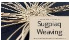
A Beginner's Guide to Sugpiaq Weaving (2022.008.002)