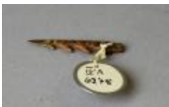
Harpoon head for otter hunting (IV A 6278)