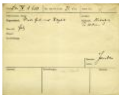
Kayak (front part) (IV A 6268)