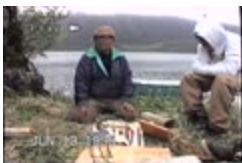
no label (CM0169)