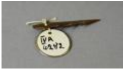
Harpoon head for otter hunting (IV A 6282)