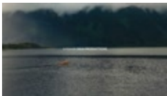
Traditional Qayaq Build (2023.013.001)