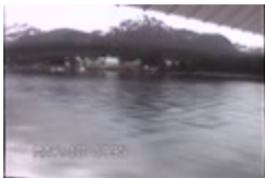
May 10 95 MALANIA (CM0167)