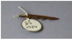
Harpoon head for otter hunting (IV A 6284)