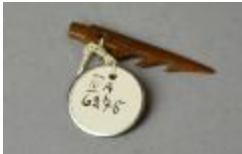
Harpoon head for otter hunting (IV A 6275)