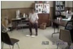
Tatitlek Afternoon 19990806 (CM0097)