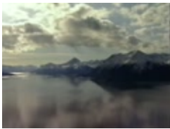
Alutiiq Pride - A Story Of Subsistence - VHS (CM0020)