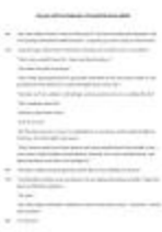
Interview with Vera Meganack 1 (STE-000-BNVM.090529)