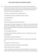
Interview with Vera Meganack 2 (STE-004-BNVM.090529)