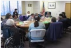
Chugachmiut Elder Meeting Tape 1 (CM0653)