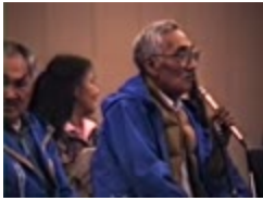
91 Gathering Native Dancers / King Island Dancers / Kodiak Dancers / Northern Lights Drummers (CM0151)