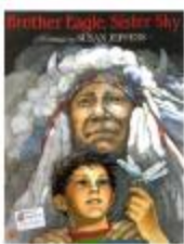
Brother Eagle, Sister Sky (BC121)