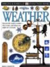
DK Weather: Discover the world's weather -- why it rains, and where you might see a tornado (BC124)