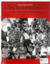
The Tlingit Indians (BA42)