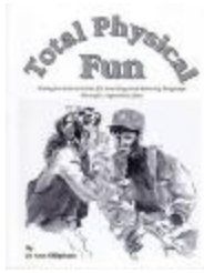
Total Physical Fun: Strategies and Activities for Teaching and Learning Language Through Cooperative Play (BA293)