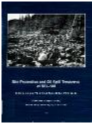
Site Protection and Oil Spill Treatment at SEL-188: An Archaeological Site in Kenai Fjords National Park, Alaska (BA339)