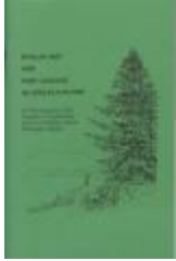
English Bay and Port Graham Alutiiq Plantlore (BA334)