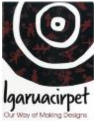
Igaruacirpet: Our Way of Making Designs (BA227)