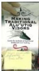
Making Traditional Alutiiq Visors (commercial release) (CM0438)