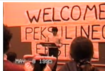
MAY 8-9 '95 (CM0159)