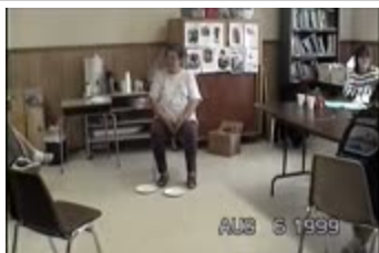
Tatitlek Afternoon 19990806 (CM0097)