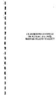
Classroom Grammar of Kodiak Alutiiq, Kodiak Island Dialect (1122.001.022)