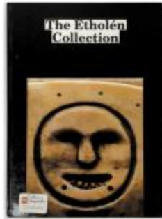
The Etholen Collection: The ethnographic Alaskan collection of Adolf Etholen and his contemporaries in the National Museum of