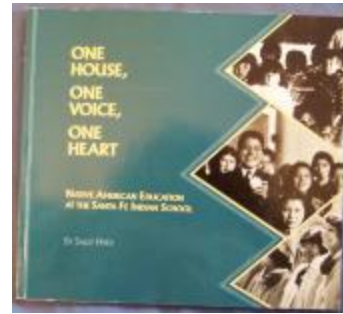
One house, one voice, one heart : Native American education at the Santa Fe Indian School (BA272)