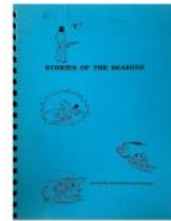
Stories of the Season (1122.002.046)