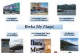
Elwika (My Village) LCI, p. 2 (2021.005.011)