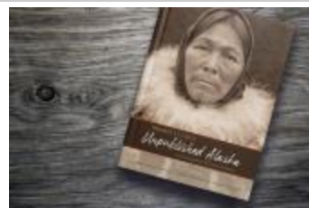
Edward S. Curtis: Unpublished Alaska Photographs & Personal Journal (BA228)