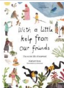
With a Little Kelp From our Friends: the Secret Life of Seaweed (BC252)