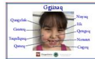
Face Poster, LCI (2021.005.010)