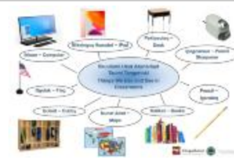
School Classroom Poster, LCI (2021.005.004)