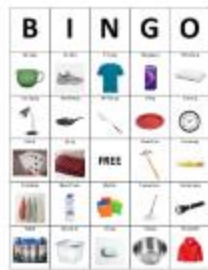
Sugt'stun Household Items Bingo (2021.005.002)