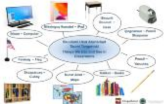
School Classroom Poster, PWS (2021.005.003)