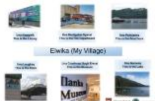
Elwika (My Village) PWS, p.2 (2021.005.012)