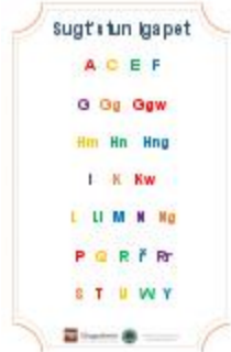
Sugt'stun Alphabet Poster (2021.005.005)